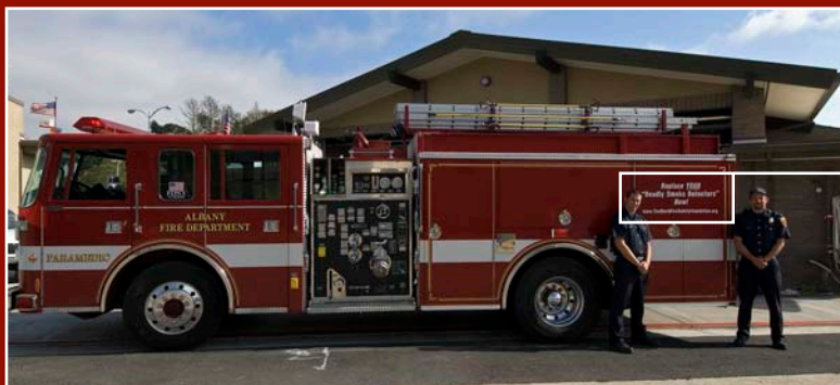
California's Albany Fire Department Warning about Ionization Smoke Alarms Deadly Defects