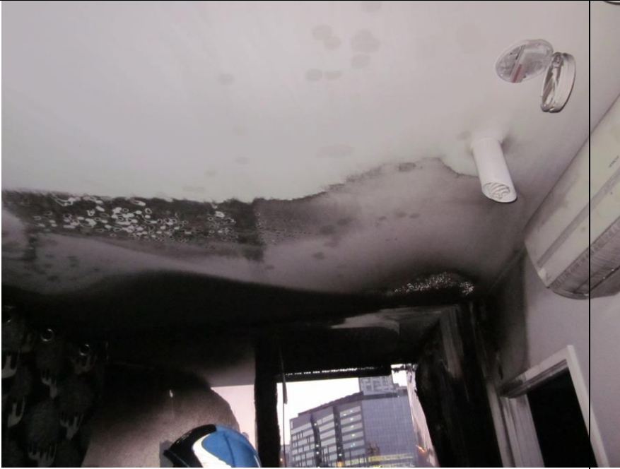
View of damaged wall and smoke detectors made inoperable. Others were covered over.