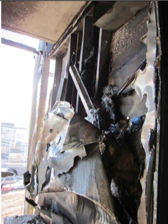
External wall at upper height