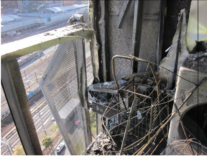
Wall between bedroom and balcony. Construction lightweight wall with steel studs, aluminium type external cladding plasterboard to internal. Material stored on balcony.