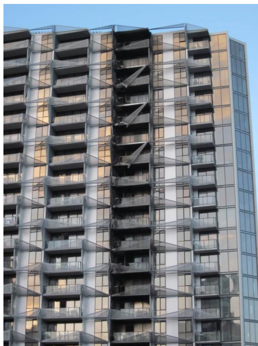
Photo Post Fire