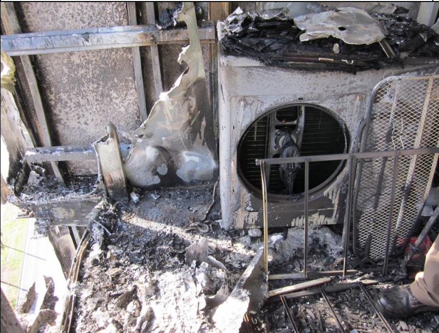
Photo of base of wall and penetrations plus overhang past balcony edge